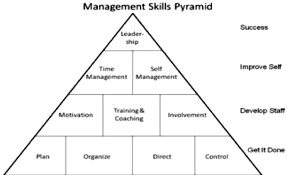
Figure 1: Pyramid of Reh (2009).