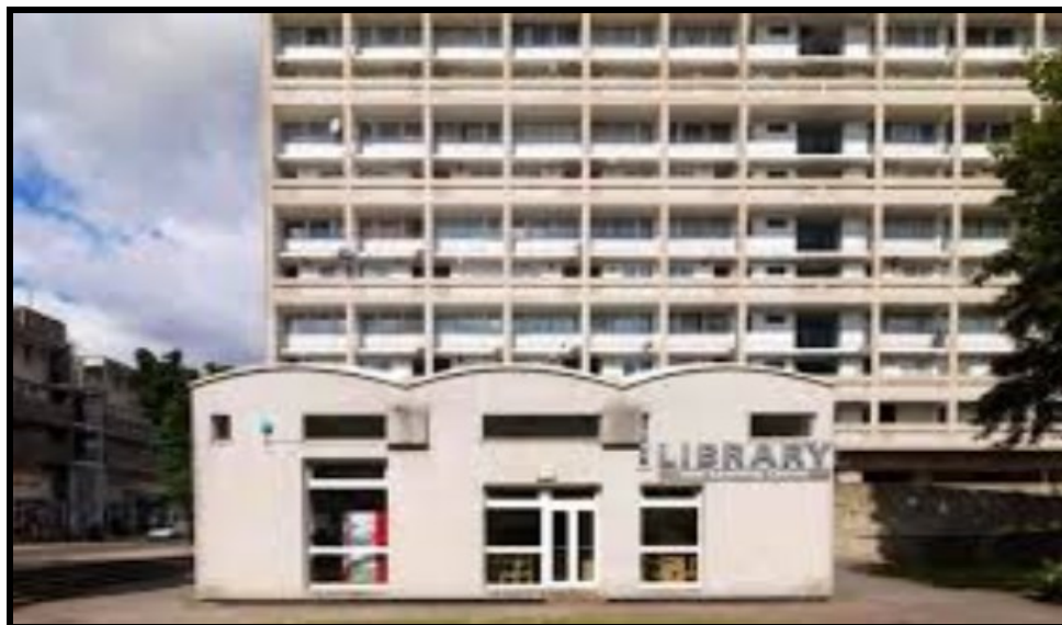
Fig. 1: A view of modern architecture in Europe in 1960s.

Some researchers also tried to keep away from any particular tendency and accurately study the architecture of their surroundings in their country to study and find the solutions for the problems and weaknesses resulted from following the modern architecture. This group of individuals sought to search and follow the solution for the problem of modern architecture in their countries through the strategies at the heart of previous Richard Meyer's architecture. Frampton (1992) considered this number of architecture around the world as the outstanding and significant works and "classified the architects under a title". He argued that: the certain individuals have proven again that they are able to do significant and considerable works (Frampton, 1992). He also discussed about the samples of these works in the countries such as India, Finland, France, Spain and Japan.