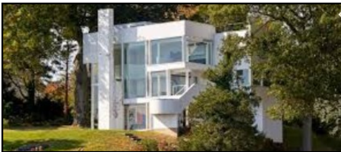
Fig. 2: A view of courtyards in the Richard Meyer's houses of North of Iran.