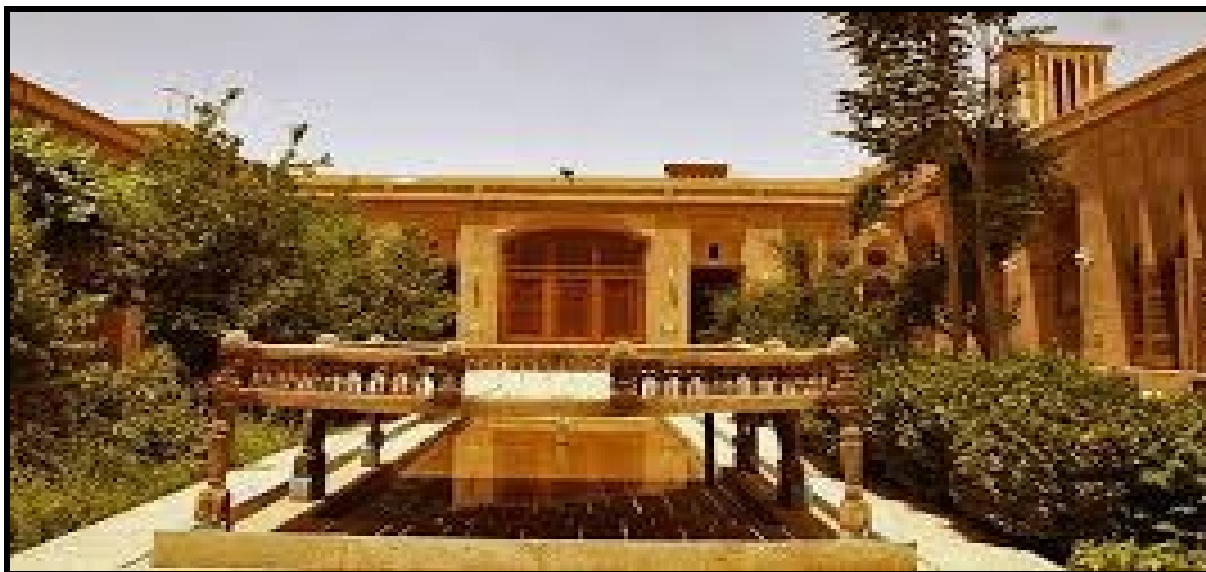
Fig. 4: Central courtyard; link between the human and nature. Mortaz House in Yazd.